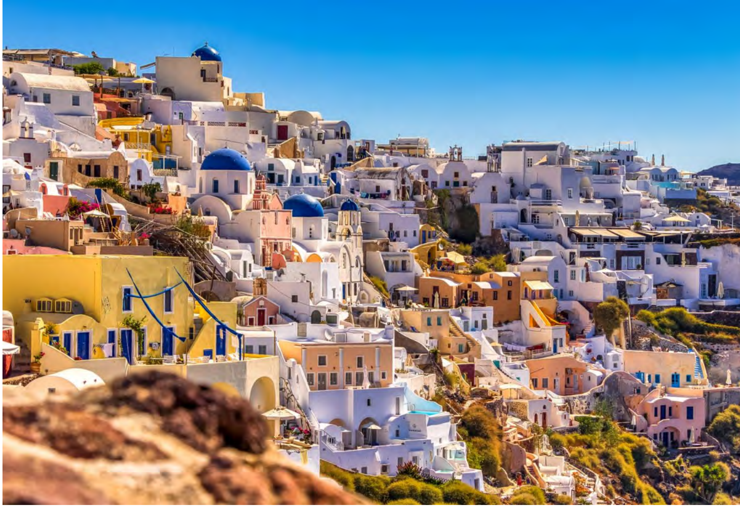
Santorini