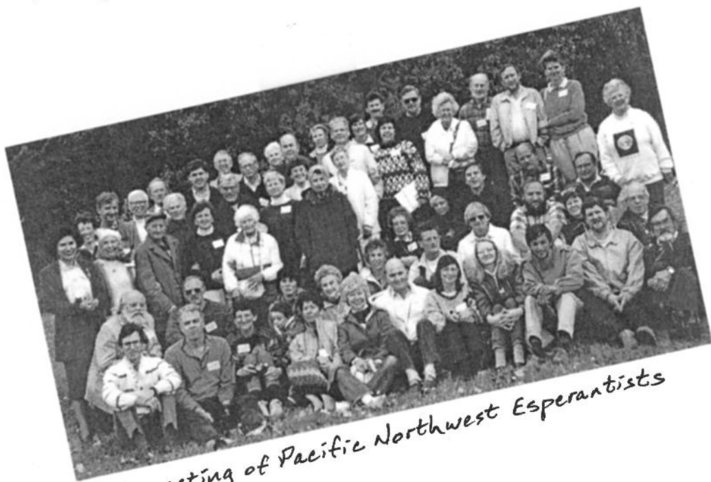
A meeting of Pacific Northwest Esperantists

Esperantists are generally quite interesting, often having diverse hobbies and jobs. For example, one man in our local group left the region several years ago to teach in Saudi Arabia for three years, and is now in Pakistan for three years. Some members of our local group were born abroad (Romania, Uzbekistan, Iran, etc.); the funny thing is that, even after being in the U.S. for many years, the English of some of them is so accented that I usually understand them more easily when they speak Esperanto.