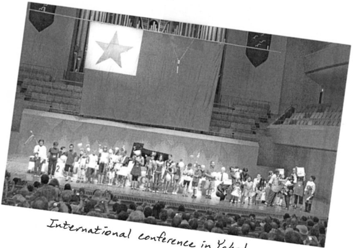
International conference in Yokohama

A side-effect of the conferences is that I've become a better public speaker. I've always been terrified of speaking before a group, even making a comment in a public meeting. But in Esperanto groups I started giving talks (about kayaking in the northwest, or ferrets as pets, etc.), knowing that my audience is friendly, and it's had a carryover effect in English settings.