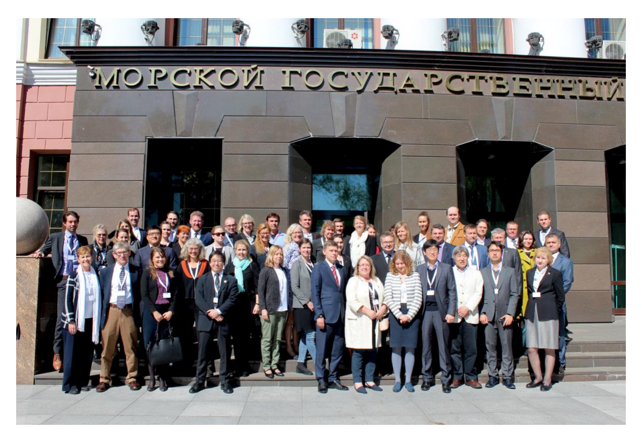
PAME II-2018 meeting participants.

Frontpage image: Russky Bridge, Vladivostok, October 1<sup>st</sup> 2018.