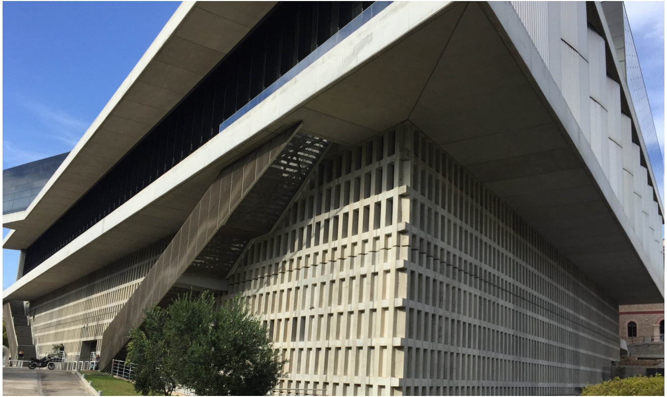
The Acropolis Museum by Bernard Tschumi, Athens, Greece.

This invitation has made it possible for me to see beautiful Athens again. After seeing so many world cities competing with each other for the tallest and most imposing, crushing buildings, I noticed more than ever that the architecture of Athens is subject to the city's rules, and no building tries to crush the city with its megalomaniac size. All buildings higher than eight or ten stories are stepped back after so many stories, so that you can always see the sky and the end of the avenue opening to the surrounding hills. On one of the long avenues leading to the Acropolis, one sees on the horizon the light shining through the columns of the Acropolis. Athens has beautiful parks and many remains from Antiquity surrounded by pine and cypress trees. All sidewalks are lined with bushes or hedges of some sort to protect the pedestrians from vehicles. Athens is a city of museums of which the new Acropolis Museum is the one that is less accommodating and fitting of ancient Greek art than any other museum like the Cycladic or the National Museum of Archeology where Schliemann's finds are displayed. Athens is green and white and blue, and it is great to be there and to breathe the Aegean breeze.