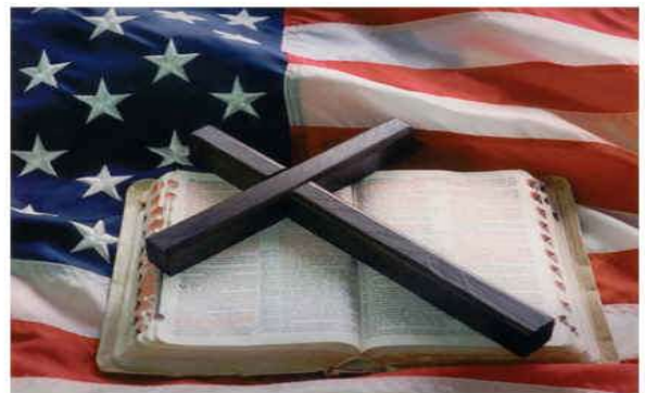
...One Nation Under God...

~ Andy Langford, UMC Discipleship Resources, Prayer for Independence Day