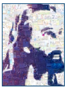
attend conference to see our 2011 mc conference logo up close, featuring a mosaic of the face of jesus made up of mission center photos

Christ's mission is our mission. From this point forward, all ministries, personnel, and resources of the World Church will be focused on the whole mission of Jesus Christ through five, life-changing, church-changing, and world-changing mission initiatives.