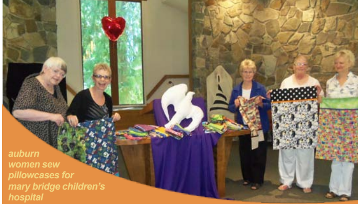
auburn women sew pillowcases for mary bridge children's hospital