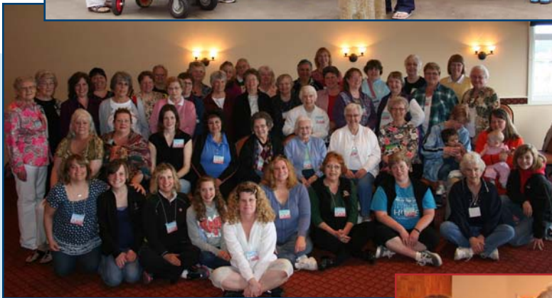
top: wa women's retreat bottom: or women's retreat