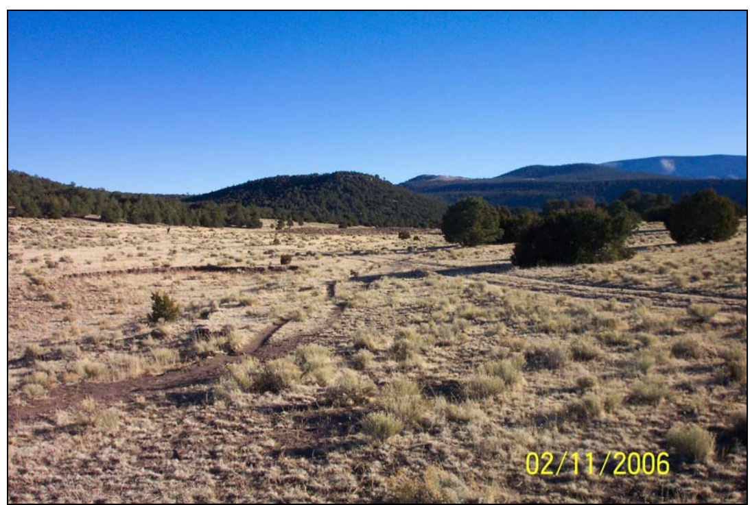
[2] View looking south with Escudilla Mountain in distance