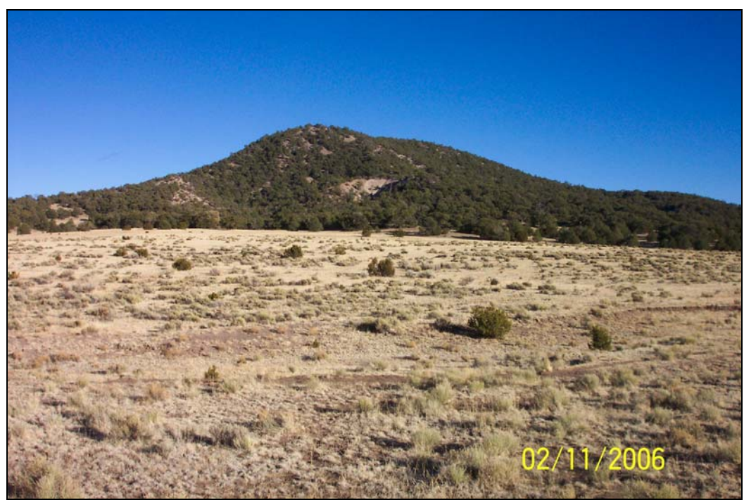
[1] Loco Knoll