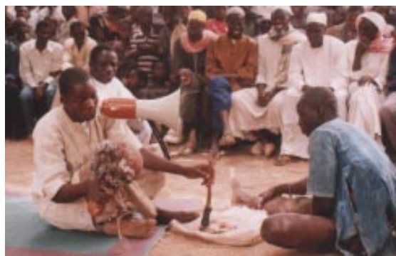
A scene from a skit during an inter-village meeting

This is related to the first step in the strategy: to identify community decision makers for the programme. A date was fixed with each village delegation to hold a general assembly for orientation and discussion with the entire village.