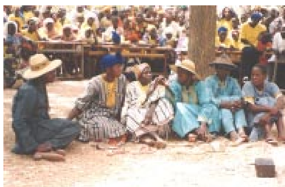
A play on HIV/AIDS presented by the participants from Siguivousse during an inter-village meeting between 11 villages in Béré