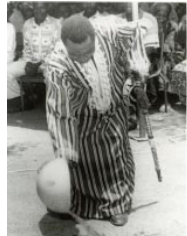
Through this ritual action, this man was given a mandate to support, in the name of their ancestors, the action taken by the women of Béré to abandon Female Genital Cutting