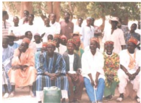
Participants who attended the inter village meeting in Sondré possible