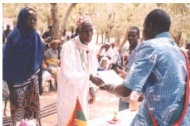
Public marriage ceremony in Bere; A female member of the audience and her husband receive their family record book after formalization of their marriage

Sixty-nine people participated in a workshop on gender-based violence. A case of discrimination related to children's education was noted.