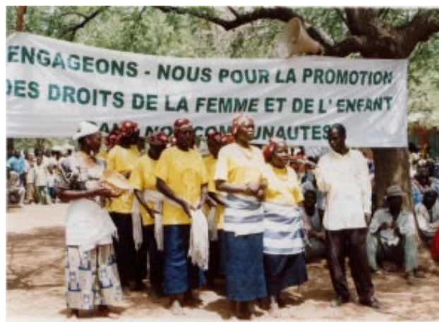
This group of women sang a song calling for the abandonment of Female Genital Cutting in all communities during the public declaration in Béré

Amongst other decisions made at the workshop, it was agreed that a spokesperson for the women would present the Béré and Bindé collective agreement. She would be followed by a representative of the traditional leaders in a symbolic gesture of support from the two districts.