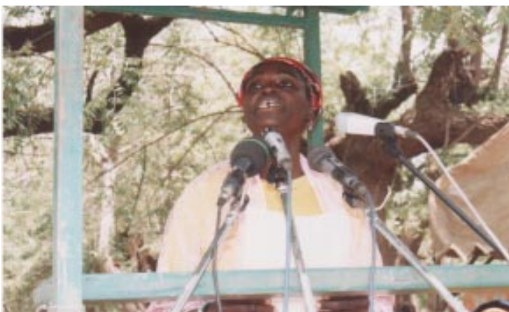
This woman standing at the special podium, calls out the names of all the communities taking part in the public declaration ceremony at Béré