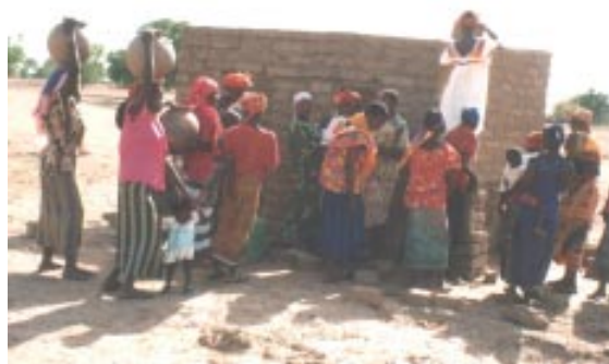
Women from Doue Taking part in the construction of a primary healthcare center in the village