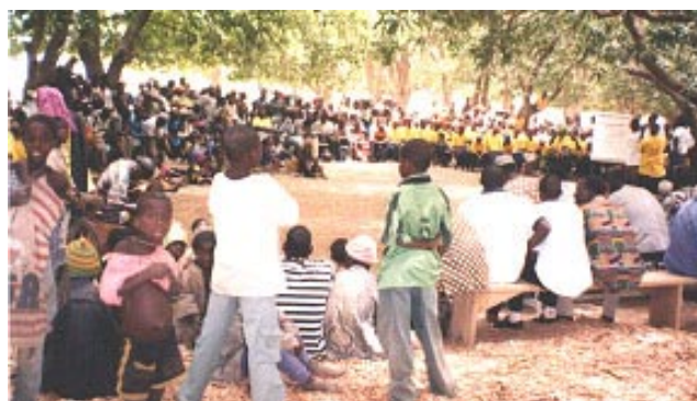
Inter-village meeting between delegates from five villages in Sondré (Béré district)

Class participants and the members of the Village Management Committees organized village meetings in each of the 23 villages to inform everyone of class sessions and activities. Class themes, along with strengths and weaknesses, were discussed and solutions proposed to the problems identified.