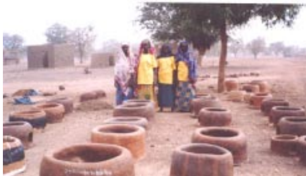
Female participants from Kondrin Village in front of the adapted wood stoves they constructed