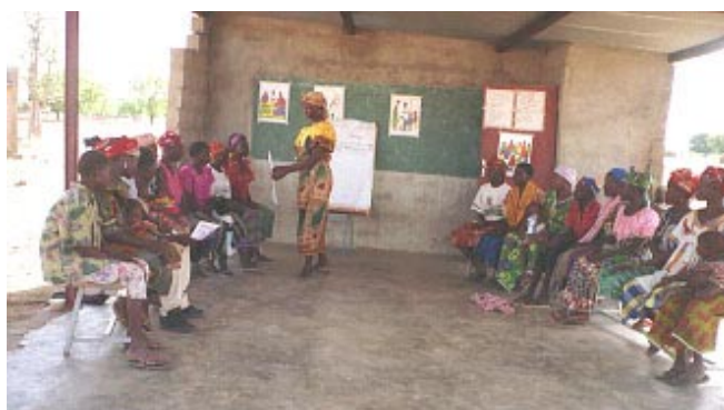
Educative sessions on human rights with the audience both (male and female) in Noghin village (Binde district)

The community facilitator followed the schedule determined by the participants and began Module 1 in February, 2001. The sessions on human rights and the problem-solving process were held every other day to allow time in between classes for assimilation of themes and sharing of new information with other members of the community. The participants implemented session activities both in the class and in the village. Participatory techniques such as dance, song, role-play, poetry and small discussion groups were