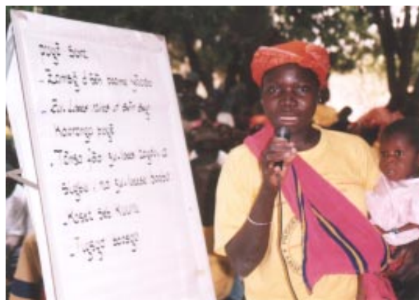
At the Sondré inter-village meeting; a female member of the Signoghin village class presents the problems that her village wants to solve

Villages sharing the same health centre (about eight villages per centre) met at the end of both cycles. During these day-long meetings, representatives from each village exchanged ideas about new information learned and activities implemented as well as pointing out strengths and weaknesses of the programme with the community leaders, development and administrative partners who attended. The participants also discussed and proposed solutions to problems that were common in all the villages. Six inter-village meetings were held. The first three were held at the end of the first two modules and the last three, at the end of Modules 3 and 4.