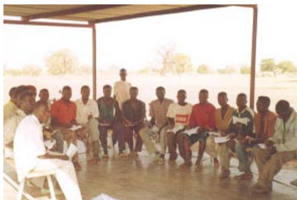
Session on problem solving with the participants of Nacombgo village (Béré district)

In participating villages, the idea was to inform everyone about new ideas being discussed by class members in order to involve them in the decision-making process. The villages that were not covered by the programme were also given information so that they could support the strategies the 23 participating villages developed. Everyone greatly appreciated these public sessions.