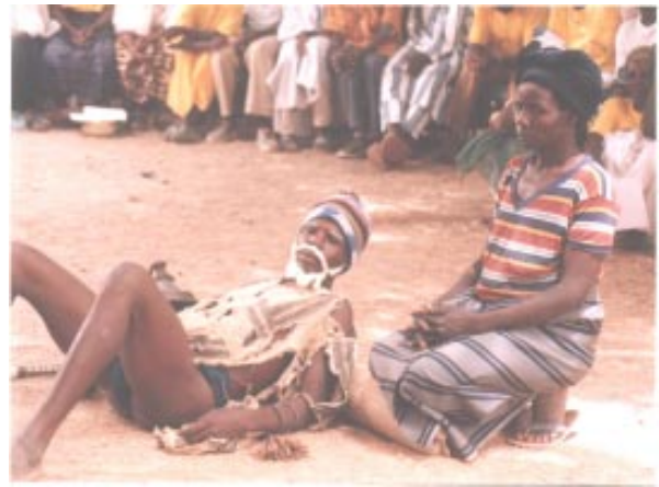
Male and female participants in Bindé present a play on the negative consequences of female genital cutting

“There is more involvement of traditional leaders in the fight against Female Genital Cutting and birth spacing.” (Female participant, Kondrin village, Béré)