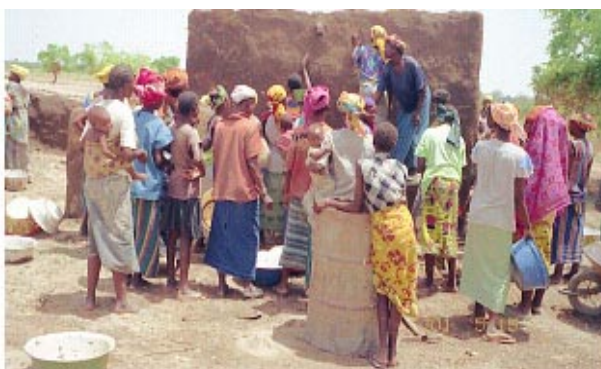
Women from Yorgho village in the process of building walls of the primary health center

Twenty-seven public sessions were held in the villages on the following topics: hygiene, FGC, sexuality, family planning, STIs and HIV/AIDS, pregnancy and vaccination. In addition, twenty-three groups for the promotion of health were established in each of the 23 villages.