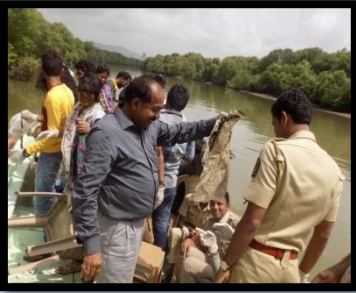
Maharashtra Forest Department officials and staff along with students, local villagers during coastal area cleanliness drives