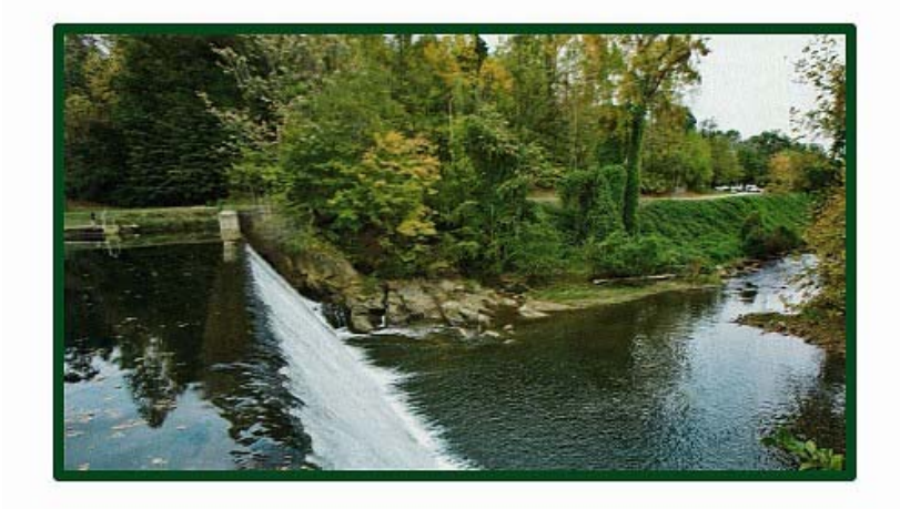
Reddies River Greenway @ spillway as seen in Southern Living

The September 2009 issue of Southern Living Magazine features an article about the Yadkin River Greenway (YRG) entitled, "Connected by a River." The article featured three beautiful scenic photos of the YRG. The focus was on the history of the Greenway and how other communities can also develop a community park using the experience of the Yadkin River Greenway Council. These include: determine the function, get the right design, secure permissions from land owners and government entities, round-up volunteers and don't give up. Southern Living considers the YRG "a big deal." Which we in Wilkes County already knew!