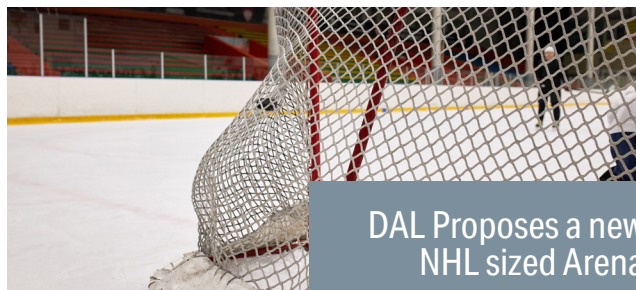
DAL Proposes a new NHL sized Arena