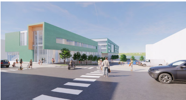
NSSC Announces New Campus in Sydney