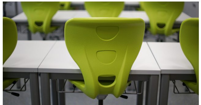
Bedford School Under Construction