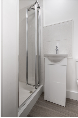
Flat 7, second-floor, 12 Eccleston Road, London, W13, 0LW 30,57 sq. m