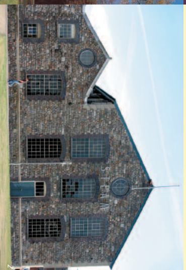
1. Holburne Museum, Bath.