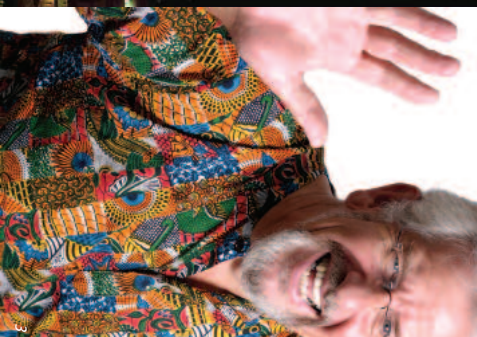
1. Isambard Kingdom Brunel (CE).