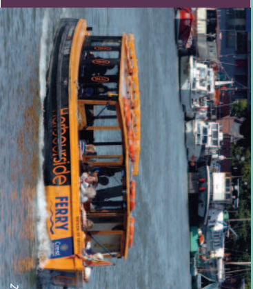
3. British Empire and Commonwealth Museum.