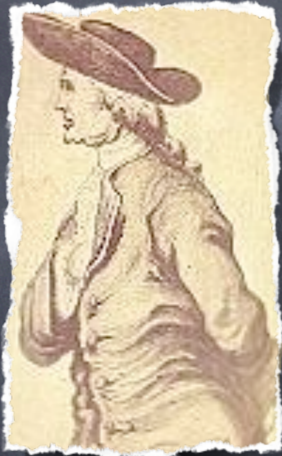
Henry Cavendish (1731 - 1810)