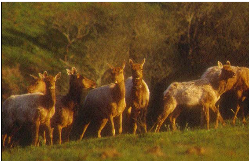
Tule elk ( Cervus elaphus nannodes ) is a subspecies of elk native to California. In 1978 tule elk were restored to Point Reyes National Seashore after being absent from the area for over 100 years.

Information on tule elk reproductive and mortality rates is critical to accurately understand the underlying factors influencing the population dynamics of this species. Radio-marking is currently the most effective method of monitoring individual animals in a free-ranging situation to determine population parameters. Radio telemetry collars were fitted onto adult female elk. Blood was taken at capture to determine pregnancy status. Radio collared elk were monitored regularly to determine their locations and survival rates. Fecal samples from collared elk have been biannually tested for Johne's disease, an exotic diarrheal wasting disease previously identified in the elk population. A sample of tule elk calves were fitted with radio telemetry collars and monitored for the first year of their lives to determine neonatal and calf survival rates.