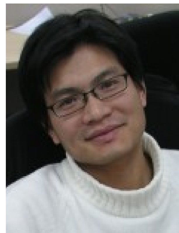
Fong Lin VBA Interoperability Project