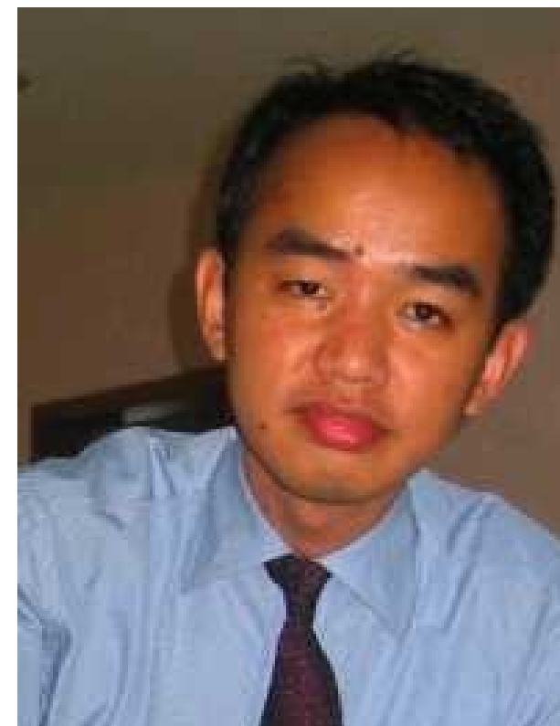
Arvino Mudjiarto Woorknet - OoO Server