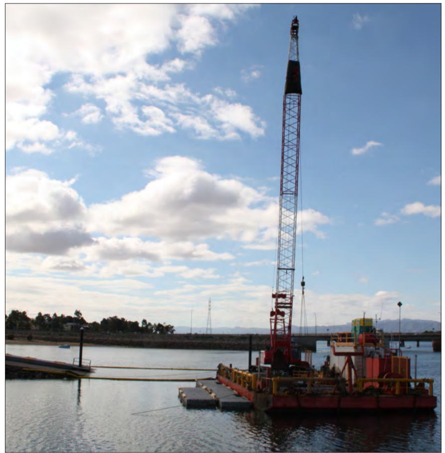
Work on extending the Carpenters Landing Boat Ramp will be completed in June.

The existing 'Ski Club' ramp is still available for use (24hours), but care must be taken when launching or retrieving at low tide. Parking may also be an issue so care must be taken to park cars well away from the traffic areas.