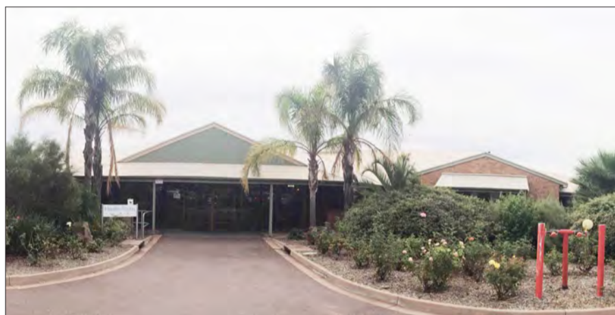
AGED CARE FACILITIES IN PORT AUGUSTA: Two of the Aged Care facilities, Nerrilda Nursing Home (left) and AM Ramsay Village (below). For more information on these facilities contact 8641 9100.

Information sourced from www.myagedcare.gov.au