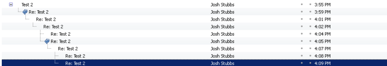
Figure 1 - Thunderbird improper threading in account which is IMAP access to an Exchange Server