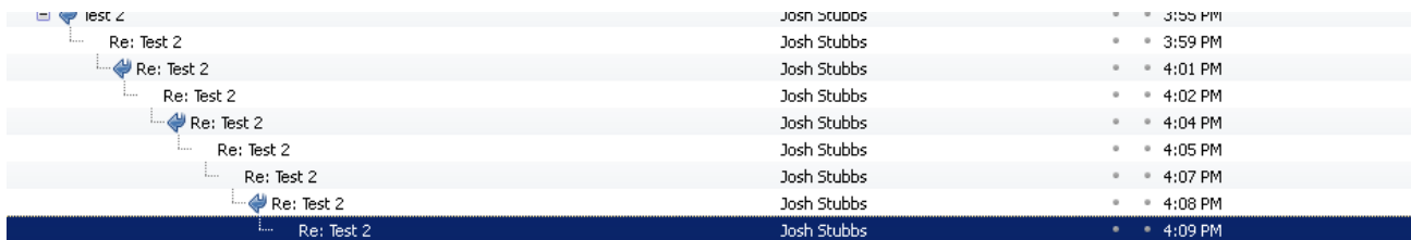
Figure 2 - Thunderbird proper threading (same email exchange) in account which is IMAP access to a non-Exchange Server