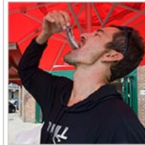
Casting for a Global Herring Market