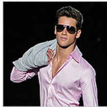
The Ornamental Male Gets a Showcase in Milan