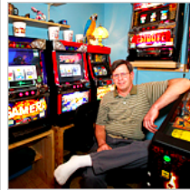
Japanese Slot Machines: Noisy, Tacky and Coveted