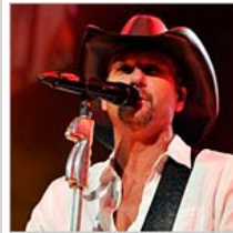
After Flood, Country Stars Rally for Nashville