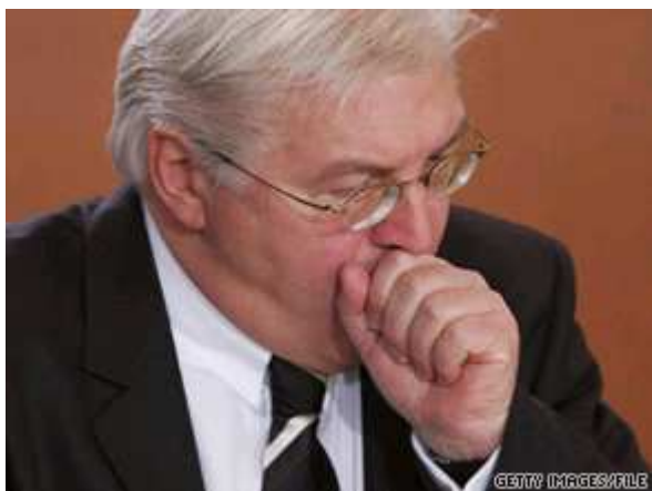
Coughing is one of the five most common reasons for a doctor's visit.

( Health.com ) -- You've been coughing for weeks. How do you know if it's just a hard-to-shake cold or something more serious?