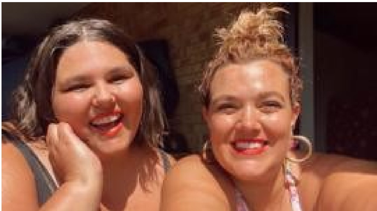
'It's not just about eat less, move more'