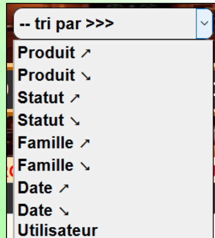
before firefox 57