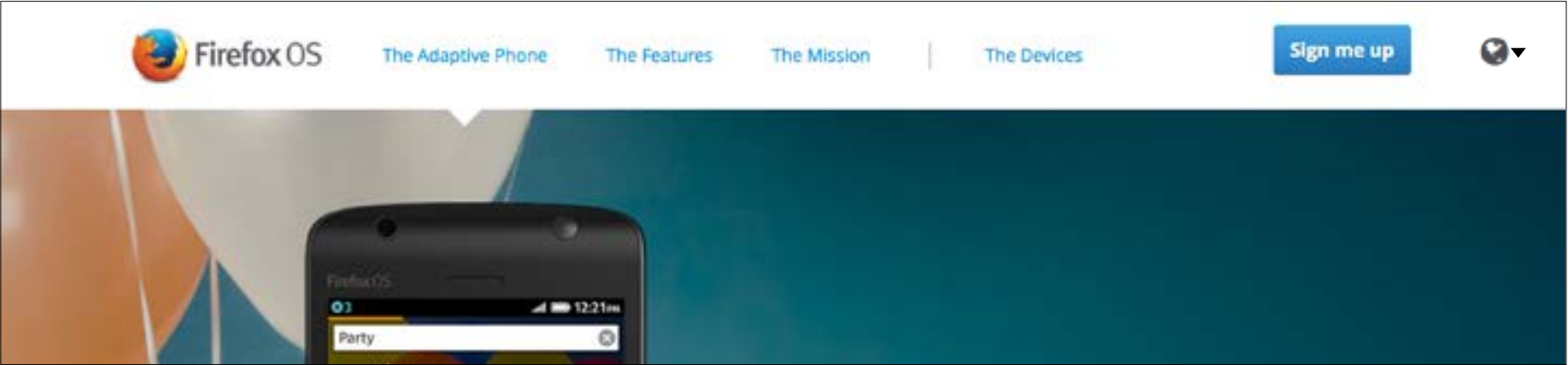
* closed menu

Generic menu contents are seen when opening language menu. Notification copy shown above is appropriate only as a welcome message. Menu contents are appropriate when opening menu any time to select language.