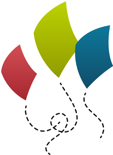
SVG picture inserted with scaling in Writer