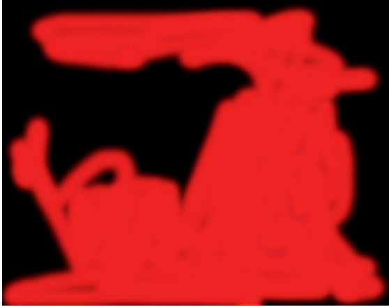
Figure 1. jdhfkds fkjhd kfjhksdjhf sdmnfsndf s,dnfmnsm,dfnmsd fjdfgdhfh dfhsgdhjf jshdfg jhsdgf sdmfmnsbdf ndsf.