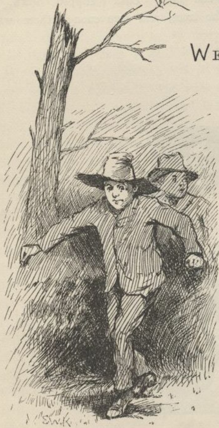
THEY TIP-TOED ALONG.

dasn't scratch it; and then my ear begun to itch; and next my back, right between my shoulders. Seemed like I'd die if I couldn't scratch. Well, I've noticed that thing plenty of times since. If you are with the quality, or at a funeral, or trying to go to sleep when you ain't sleepy—if you are anywheres