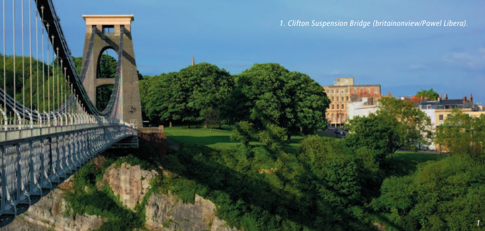
1. Clifton Suspension Bridge (britainview/Pawel Libera).