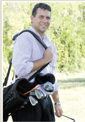
● Mr Tollner wants action.

A FEDERAL MP wants Northern Territory parents to arm their children with cricket bats and golf clubs and smash cane toads for six.