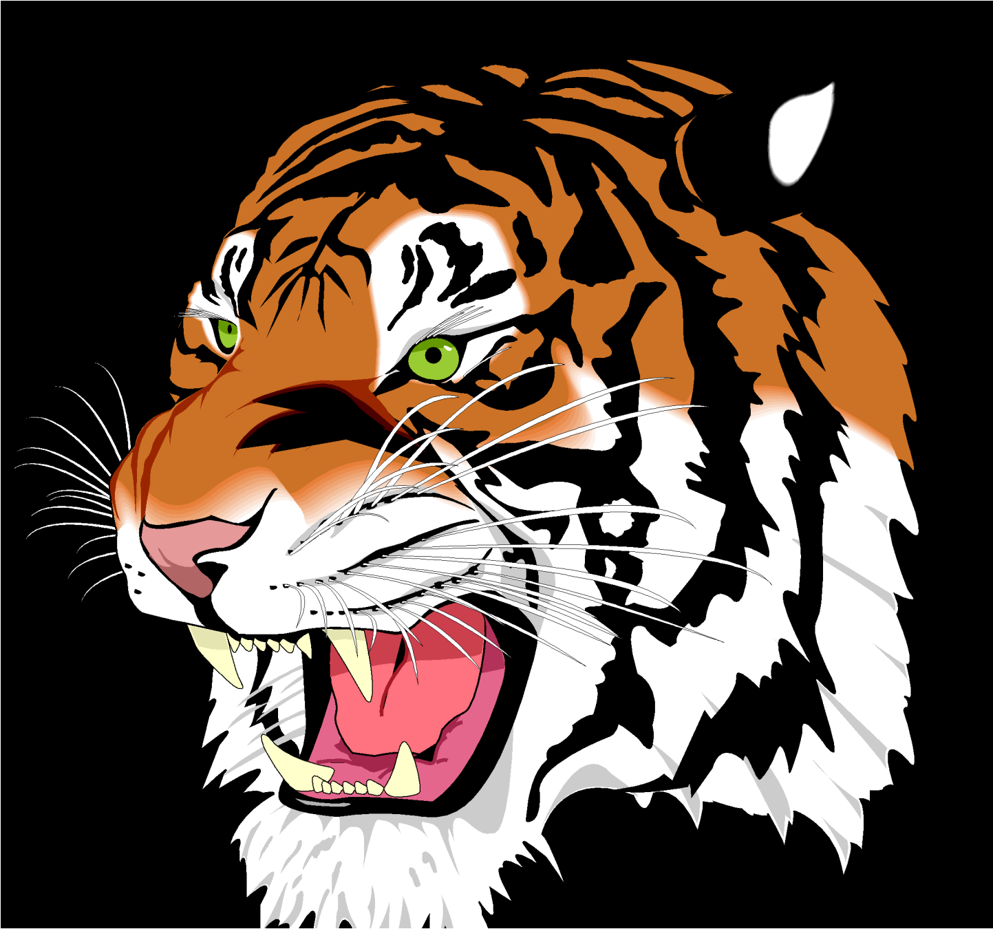
Some examples of how to embed an SVG image inside your FO documents